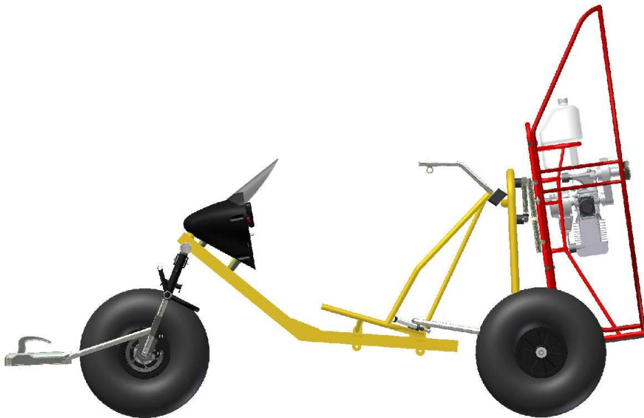
Version „Big Wheel“

The BulliX comes in 2 versions with different wheel sizes: