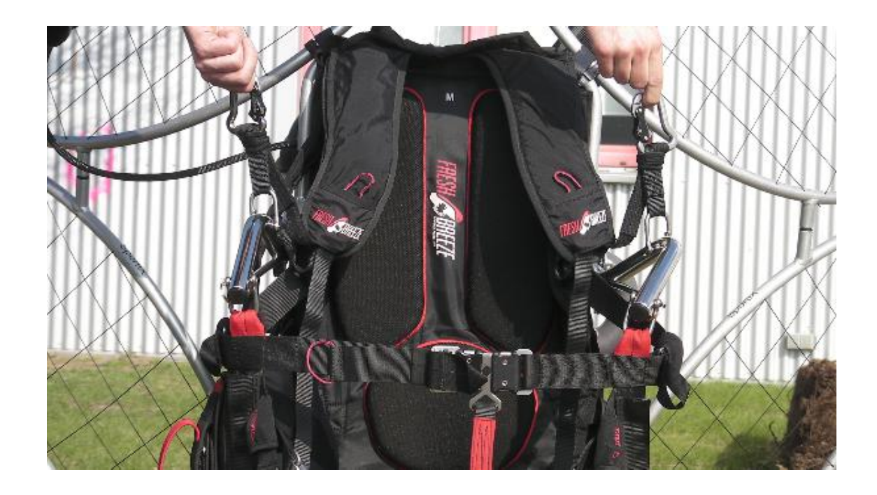
The left pushrod is twisted outward. This compensates the constant left-hand twist very efficient.